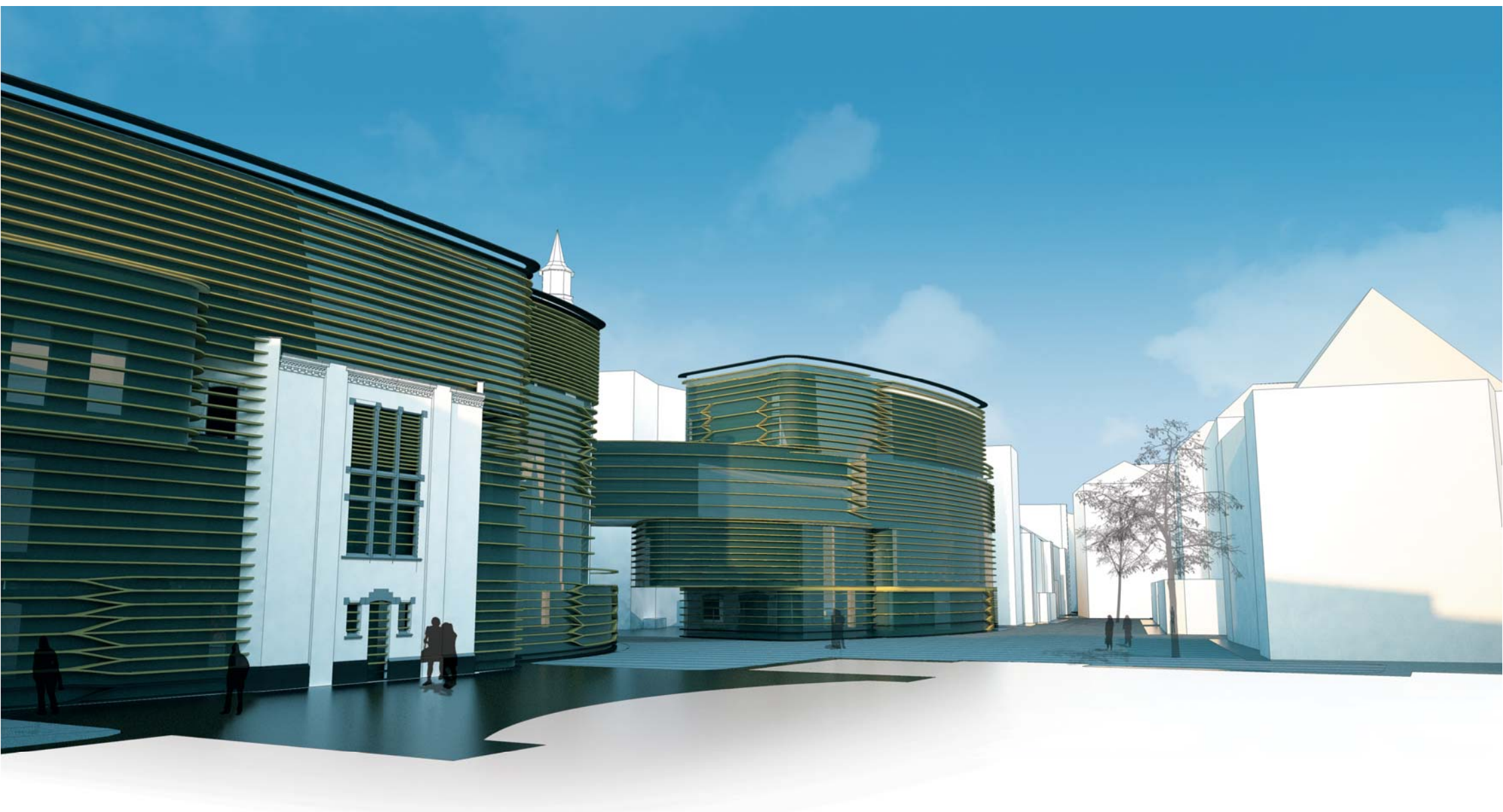
PLAZA VIEW TOWARDS TURFDRAAGSTERPAD

ITS HOSPITAL COUNTERPARTS ON THE LOCATION WITH ONLY FEW NATURAL STONE ORNAMENTS. BUT INSIDE THE RATIONAL CHARACTER SHOWS A LOGICAL AND CLEAR SUPPORT STRUCTURE AND ROUTING. ALL EVIDENCE OF THE CHANGING POSSIBILITIES THAT THE 19TH CENTURY BROUGHT IN CONSTRUCTION AND HOSPITAL DEVELOPMENT. THE DIRECTION OF THE STEEL FLOOR BEAMS DIVIDES THE BUILDING IN CLEAR CORRIDOR AND FUNCTION SPACES. THE L SHAPE OF THE BUILDING FURTHERMORE VISUALLY EMBRACES THE GREEN GARDEN PATIO, HIDING IT AND ONLY REVEALING HINTS OF IT BY MEANS OF A BIKE PASSAGE AND NARROW ENTRANCE GATE. PASSAGES LIKE THIS, BETWEEN OPEN PUBLIC SPACES ARE CHARACTERISTIC FOR THE BINNEN GASTHUIS LOCATION.