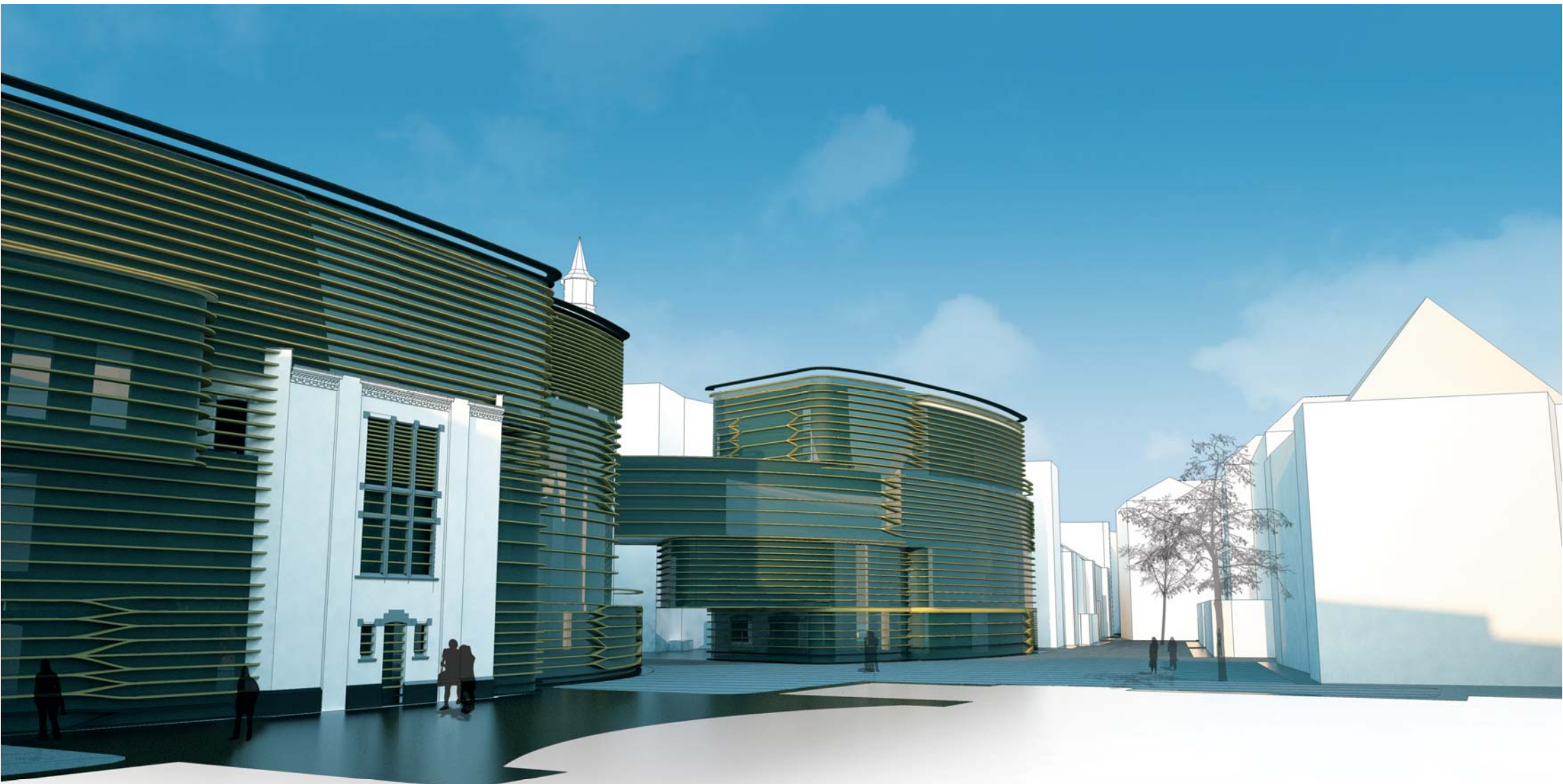
PLAZA VIEW TOWARDS TURFDRAAGSTERPAD

ITS HOSPITAL COUNTERPARTS ON THE LOCATION WITH ONLY FEW NATURAL STONE ORNAMENTS. BUT INSIDE THE RATIONAL CHARACTER SHOWS A LOGICAL AND CLEAR SUPPORT STRUCTURE AND ROUTING. ALL EVIDENCE OF THE CHANGING POSSIBILITIES THAT THE 19TH CENTURY BROUGHT IN CONSTRUCTION AND HOSPITAL DEVELOPMENT. THE DIRECTION OF THE STEEL FLOOR BEAMS DIVIDES THE BUILDING IN CLEAR CORRIDOR AND FUNCTION SPACES. THE L SHAPE OF THE BUILDING FURTHERMORE VISUALLY EMBRACES THE GREEN GARDEN PATIO, HIDING IT AND ONLY REVEALING HINTS OF IT BY MEANS OF A BIKE PASSAGE AND NARROW ENTRANCE GATE. PASSAGES LIKE THIS, BETWEEN OPEN PUBLIC SPACES ARE CHARACTERISTIC FOR THE BINNEN GASTHUIS LOCATION.